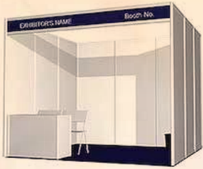
Shell Type (3m x 3m)